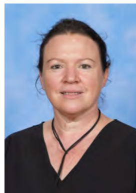
Jo - I was once chased by a silverback mountain gorilla in Africa.