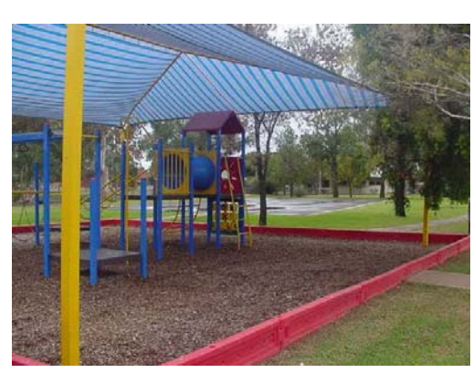
Our play equipment with our new asphalt games court in the background.

We are truly enjoying our brand new school!