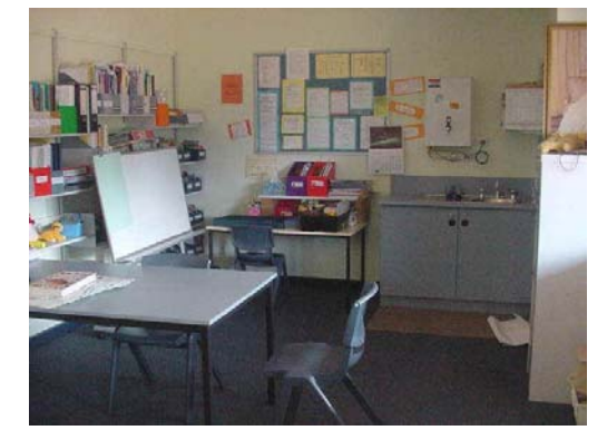
The library office/STLD/Reading Recovery Room.