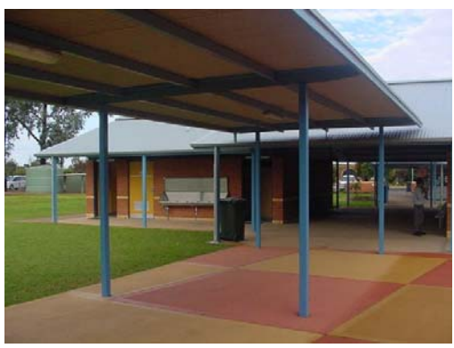
The new bubblers and toilet block for our students also houses excellent disabled facilities.