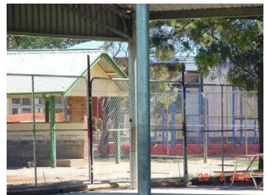
The old bubblers were sectioned off and new ones were put in close to the canteen.