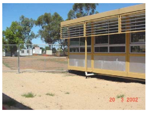
Year One got a great view of the rebuild!