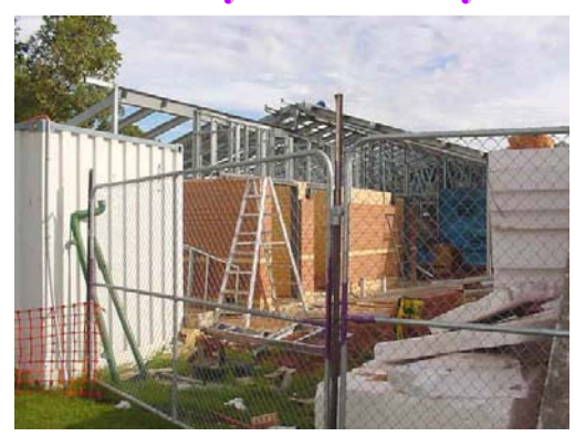
The walls of the toilet block!