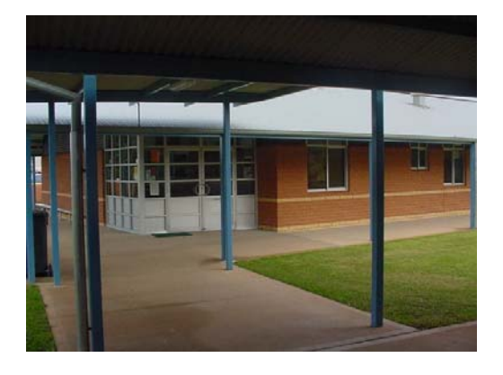
Entry into the school office.