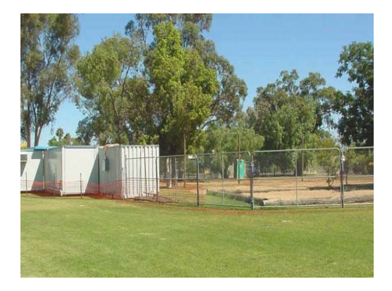
The fencing in place ready to begin the new buildings.