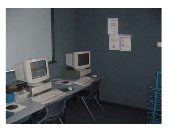
A computer withdrawal room between two adjoining classrooms.