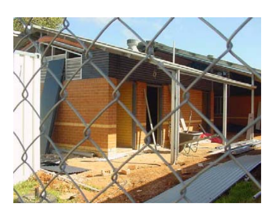
The new toilets.