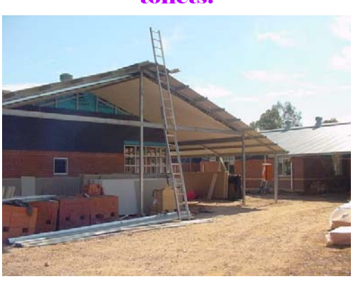
The main office and entry to the school.