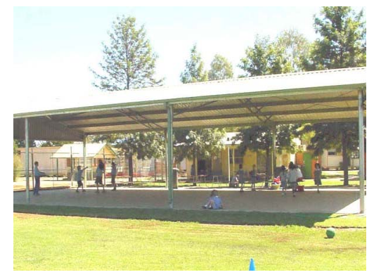
The Covered play was moved directly into it's permanent position.

The series of photos below takes you along the journey of the rebuild of Yenda Public School from the beginning to the end. We hope you enjoy the timeline!