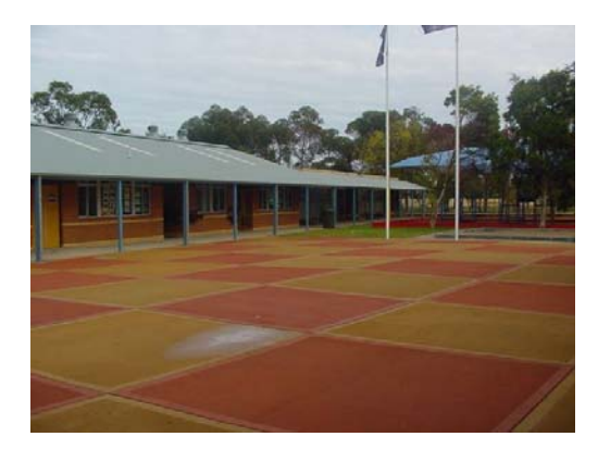
The infants classrooms and our wonderful coloured squares that are well used for playground games!