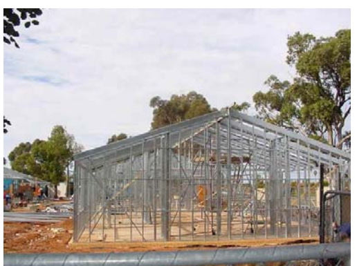
Main Office and Senior

With the crane in, the framing took no time at all!