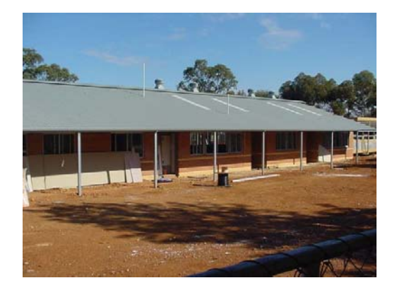
Kinder and Year 1 rooms.