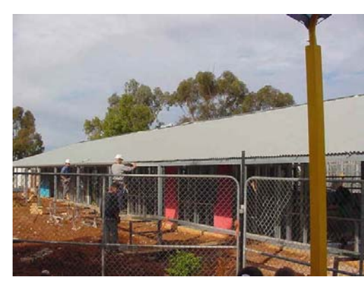
On goes the roofing.