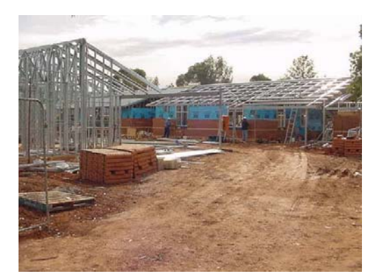
The view from the new school entry.