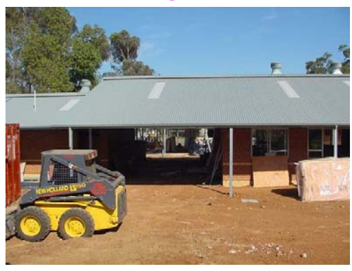
The covered walk way to the toilets.