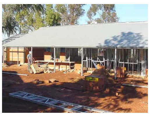
The library building well under way.